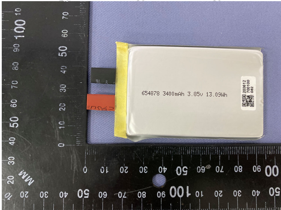
Figure 3 Overall view of cell (电芯图)