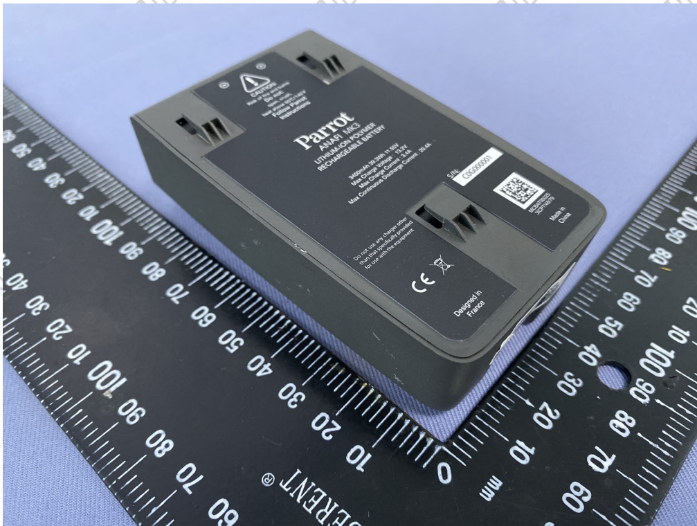
Figure 2 Overall view II of battery (外观图II)