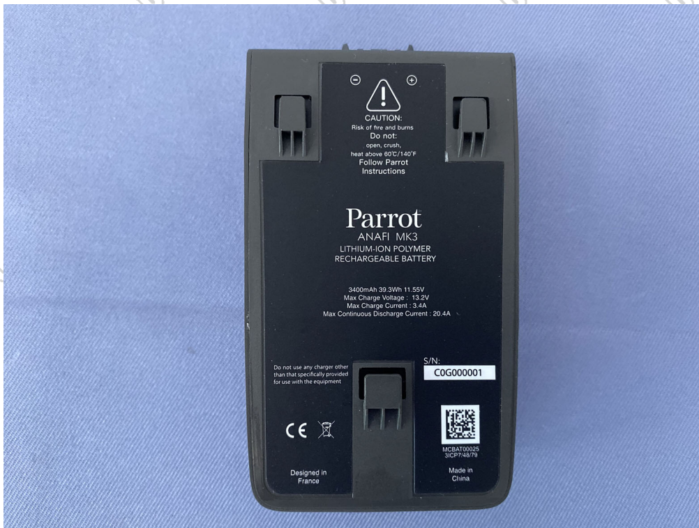
Figure 4 Battery Label (电池标签)